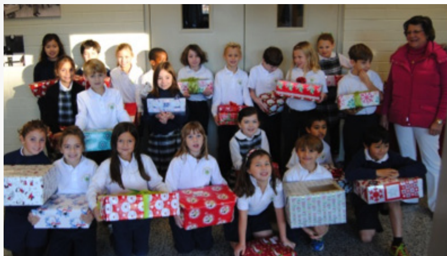
Each year children at St. Thomas More Catholic School provide a "shoebbox Christmas" for children in Appalachia.

growth the Endowment currently assists between 80-90 students and their families through tuition assistance grants each year.